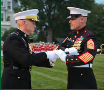
Commander of the Marine Corps Gen. James F. Amos hands of the Marine Corps Micheal Barrett during a relief and appointment ceremony at Marine Barracks Washington June 9, 2011. Barrett took charge as the 17th Sergeant Major of the Marine Corps as Sgt. Major of the Marine Corps,