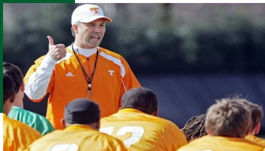
Dave Clawson coaching at U of T.