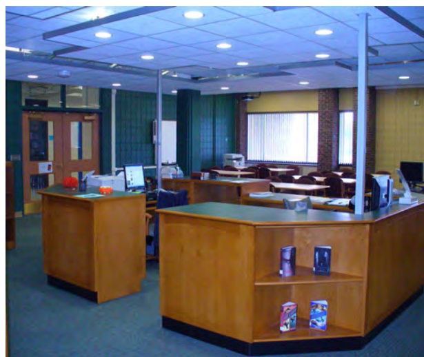
The new look in the Senior High School Library with construction completed on removing the circular staircase giving the library much more space.