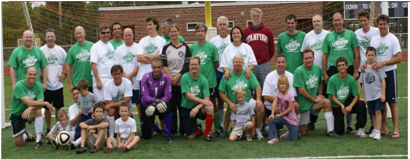
Saturday, September 26th former soccer players from Lew-Port held their 20th Annual Alumni Soccer Game at Harry K. Blakeslee Field.

Mail to: Lew-Port Alumni Association, Senior High School, 4061 Creek Road, Youngstown, NY 14174