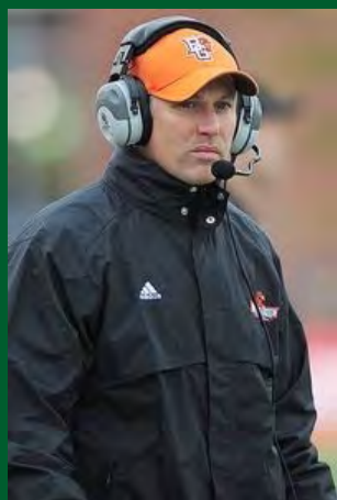
Dave Clawson Head Coach at Bowling Green

He enjoys gardening at his White Plains and Lewiston homes, still plays slow-pitch softball and only in the last few years stopped playing platform tennis.