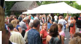
Crowd at The Jug