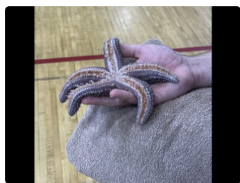
Beauty in the Sea

The kids were excited to encounter sea creatures they have been researching