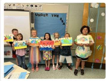
Learning Under the Sea