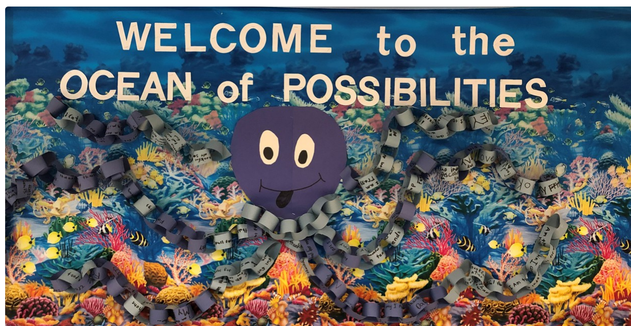
Summer Wall of the Halls