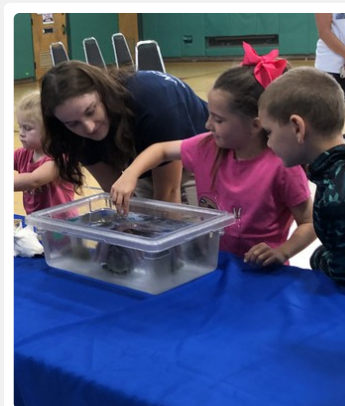
Touch Tank Encounter