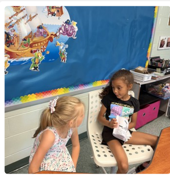
Shared Partner Reading & Writing