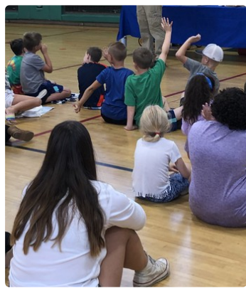
Aquarium of Niagara Inquiries