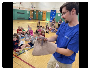
WOW !! How cool is this Sea Creature!