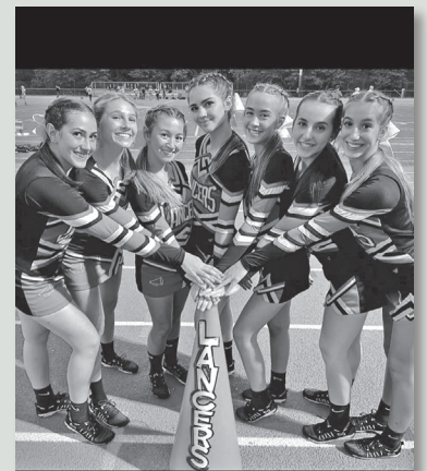
Lew-Port Senior Varsity cheerleaders.